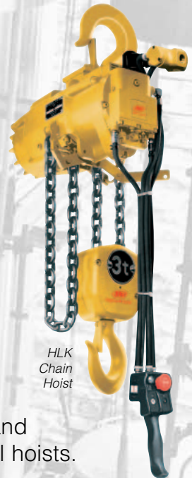
HLK Chain Hoist