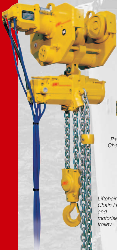
Palair Plus Chain Hoist