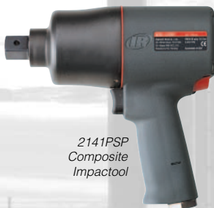
2141PSP Composite Impacttool