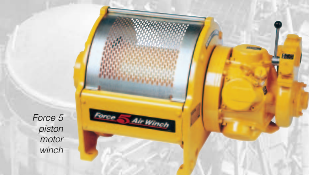
Force 5 piston motor winch