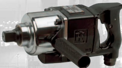
2934B2SP-EU Alloy Impacttool