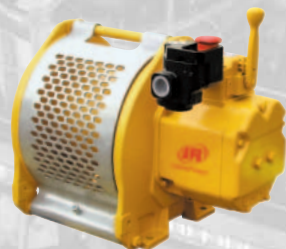
LS gear motor winch