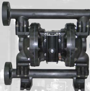
Carbon Fiber Series Pump